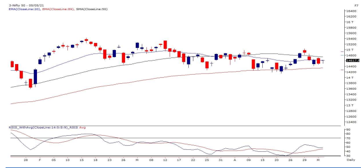
Exhibit 1: Nifty Daily Chart

Yesterday, the day clearly belongs to the PHARMACEUTICAL stocks as we saw some of the large cap counters soaring as if there is no tomorrow. Hence, traders should still look to identify such potential moves in order to get better trading opportunities.