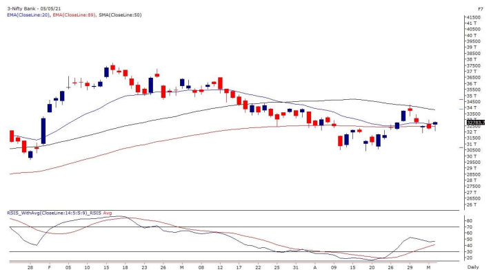
Exhibit 2: Nifty Bank Daily Chart

It been third straight session, wherein the BankNifty has shown some buying attraction around the support zone of 32000-32200 ; this also coincide with the 89 EMA in the daily chart that is placed around 32400 . Despite some initiative by RBI yesterday to provide relief to borrowers affected by the second wave of Covid, we hardly saw any major price action in our market. We have been mentioning, that the index has been stuck in a range of 32000-34000 and until we don't see any decisive move beyond these levels traders are advised staying light on positions especially in index.